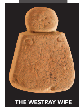
THE WESTRAY WIFE

www.westraycommunity.co.uk Email CAW@westraycommunity.co.uk