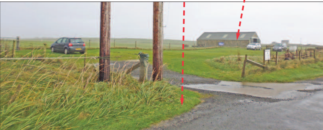
Car parking at the Golf Club