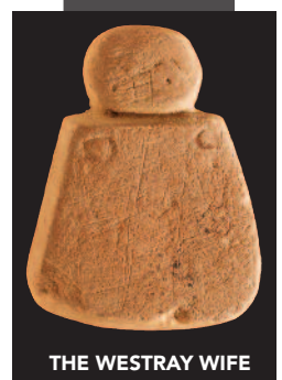
THE WESTRAY WIFE