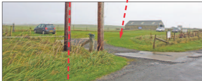
Car parking at the Golf Club