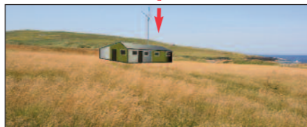
Proposed site for information facility