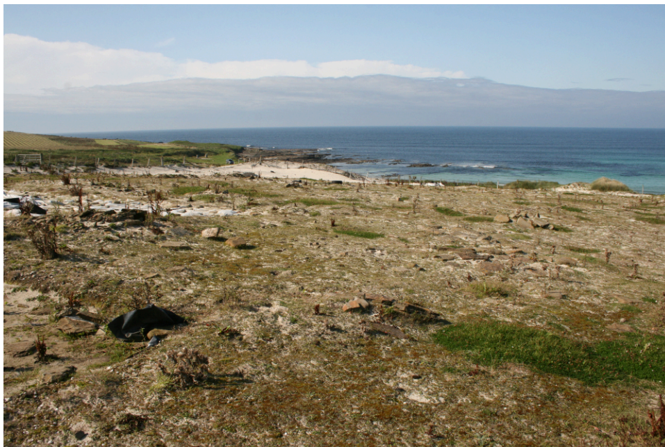
There is very little left to see now the dig has been completed.